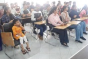
ಕಾರ್ಯಕ್ರಮದಲ್ಲಿ ಪಾಲ್ಗೊಂಡ ವಿದ್ಯಾರ್ಥಿಗಳು

ಕನ್ನಡದ ಉಪನಿಷತ್ತುಗಳಿನಿಂದ, ಸಾಮಾಜಿಕ ಕಳಕಳಿಯ ವಸ್ತುವುಳ್ಳ, ಆಧುನಿಕ ಸಂವಿಧಾನದಂತಿರುವ ವಚನಗಳನ್ನು ಪರಿಚಯಿಸುವುದು. ವಚನಕಾರರ ಸರಳ ವಚನಗಳನ್ನು ಓದಲು ಪ್ರೇರೇಪಿಸುವುದು ಮತ್ತು